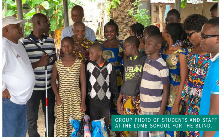
GROUP PHOTO OF STUDENTS AND STAFF AT THE LOMÉ SCHOOL FOR THE BLIND.