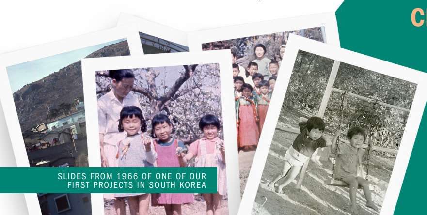
SLIDES FROM 1966 OF ONE OF OUR FIRST PROJECTS IN SOUTH KOREA

This means we will be celebrating our 60TH ANNIVERSARY next year! Join us as we praise the Lord for his steadfast faithfulness over the decades. Stay tuned for details about celebration activities!