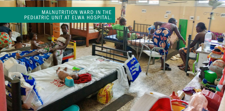
MALNUTRITION WARD IN THE PEDIATRIC UNIT AT ELWA HOSPITAL.