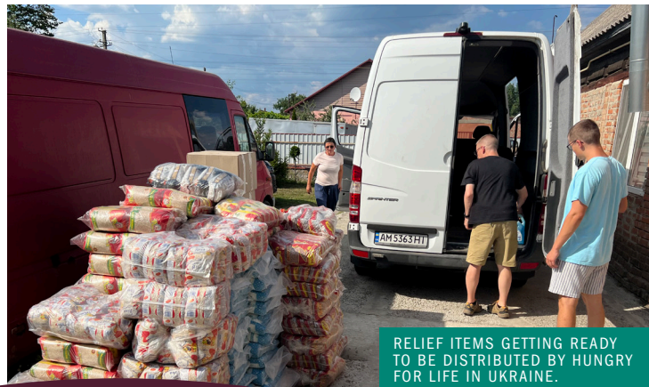
RELIEF ITEMS GETTING READY TO BE DISTRIBUTED BY HUNGRY FOR LIFE IN UKRAINE.

We are also supporting pastors in the work that they do, both in Ukraine (where they are subject to tough limitations), and in neighbouring Hungary, where they assist and support Ukrainian refugees and displaced individuals - all with the gospel in hand.