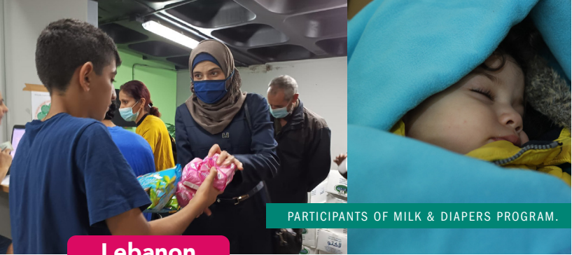
PARTICIPANTS OF MILK & DIAPERS PROGRAM.