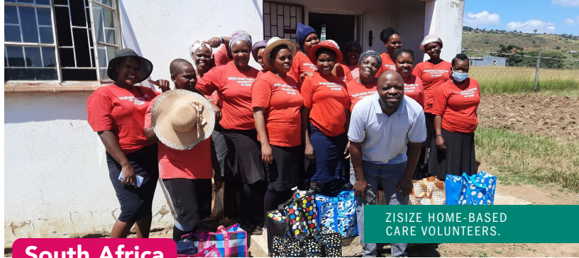
ZISIZE HOME-BASED CARE VOLUNTEERS.

It has also played an important role in enhancing the outreach of local churches to meet basic needs, helping them to show compassion and hope to their neighbours facing intense economic hardship. As one partner explained, “The people we serve can’t even provide food for their children. Many families cannot buy milk for their young children, so they mix water with corn flour or bread instead. These families are not used to being taken care of with unconditional love. It makes a huge difference when we help them in a way that reflects the love Jesus showed us. It is amazing that people who are living very far away think about them and have on their heart to help them.”