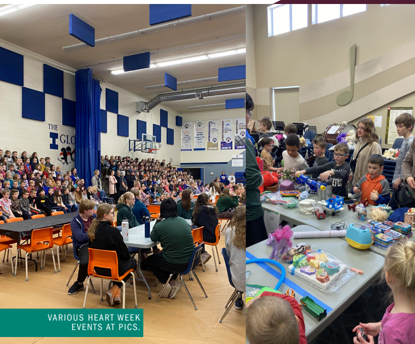
VARIOUS HEART WEEK EVENTS AT PICCS.