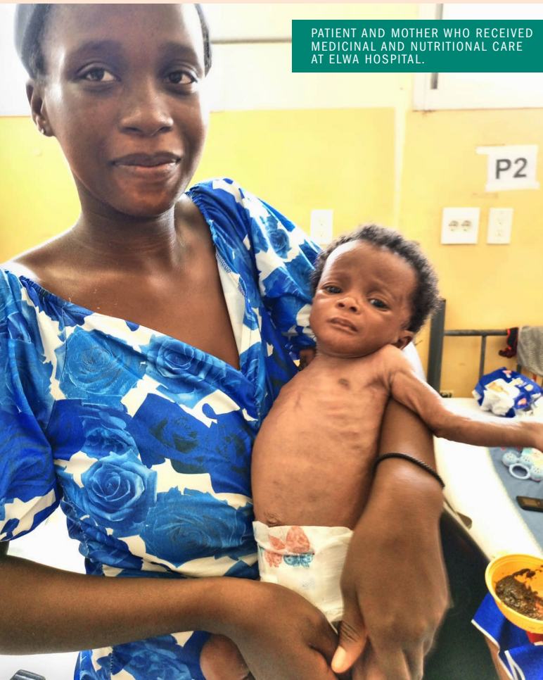
PATIENT AND MOTHER WHO RECEIVED MEDICINAL AND NUTRITIONAL CARE AT ELWA HOSPITAL.

Thank you for your generosity, which allows us to continue supporting development and relief projects that serve local communities and their most vulnerable community members. Please join us in praying for the staff of our partner organizations. Due to the extremely challenging contexts that these individuals are often in, the work can be heavy and draining. In reports we receive, our partners regularly express sincere appreciation for the support, and acknowledge that the need in their communities continues to be high. Please also join us in praying for the participants in the various projects. Through their participation, may they come to recognize that the world is not as it ought to be and that the God who made them is a father to the fatherless and a protector of widows. May they experience the help that we are able to provide as a way that believers in Christ – even from distant countries! – are sharing his love with them.